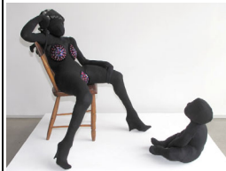
Lesser Madonna , 2009

Mixed materials, panty hose, lights, stitching, fabric and found objects, 6 – 12 inches square each.