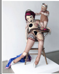
Shape Sorter , 2009

Mixed materials, baby bottle nipples, panty hose, stitching, fabric and found objects, 20 x 17 x 17 inches.