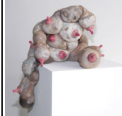
Mother Sucker , 2009

Mixed materials, panty hose, stitching, fabric and found objects, 21 x 22 x 15 inches.