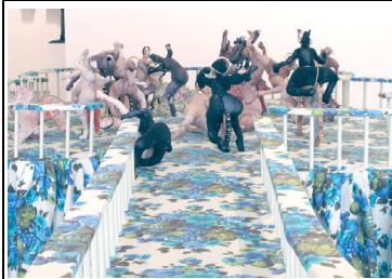
Parallel Play , 2009

Mixed materials, panty hose, stitching, fabric, baby blocks and found objects, 64 x 29 inches approx. dimensions variable.