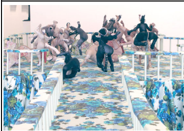
Parallel Play, 2009

Mixed materials, panty hose, stitching, fabric, baby blocks and found objects, 64 x 29 inches approx. dimensions variable.