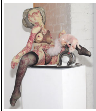
Happy Cat , 2009

Mixed materials, panty hose, stitching, fabric and found objects, 21 x 22 x 15 inches.