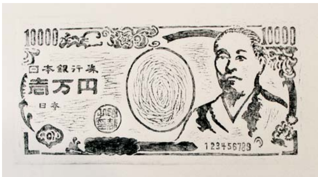
Akemi Maegawa, Counter-Foot Money , 2008. Woodblock print on Japanese paper, AP. Paper size: 10 x 21 in.