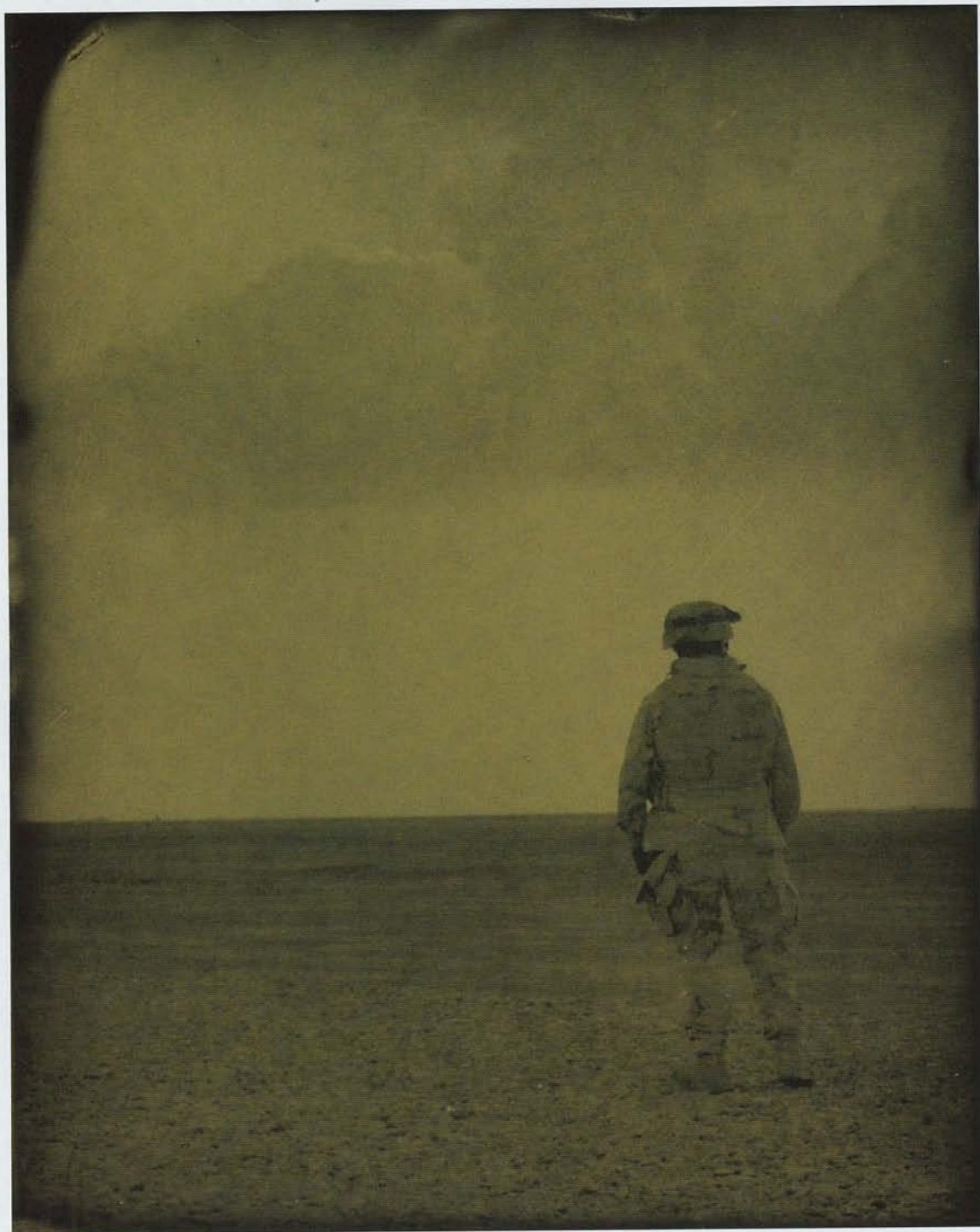
Thoughts of Home.