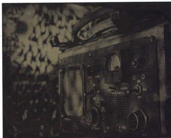
COM4 Power Supply.

I feel that the resulting tintypes are successful in blurring the visual boundaries of armed conflict ranging from the American Civil War to Vietnam and Iraq. These images also blur the boundaries of photographic processes as well by mixing cutting edge digital technology and historic techniques. I created this series with a sense of openness and ambiguity in mind: with enough left unsaid or unknown, I hope to allow viewers to explore the images and come to their own conclusions about their meaning—to them, to others. Many who have viewed the images in person often make reference to their haunting, sometimes surreal visual impact. In this I feel I've been successful in conveying some small piece of my own experiences in creating them.